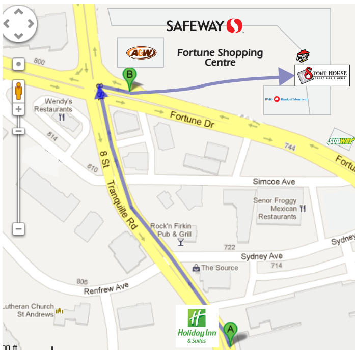
Directions from Holiday Inn to the Stout House